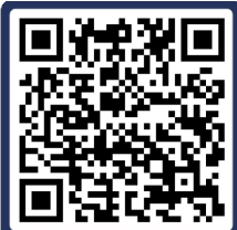
Scan to view property